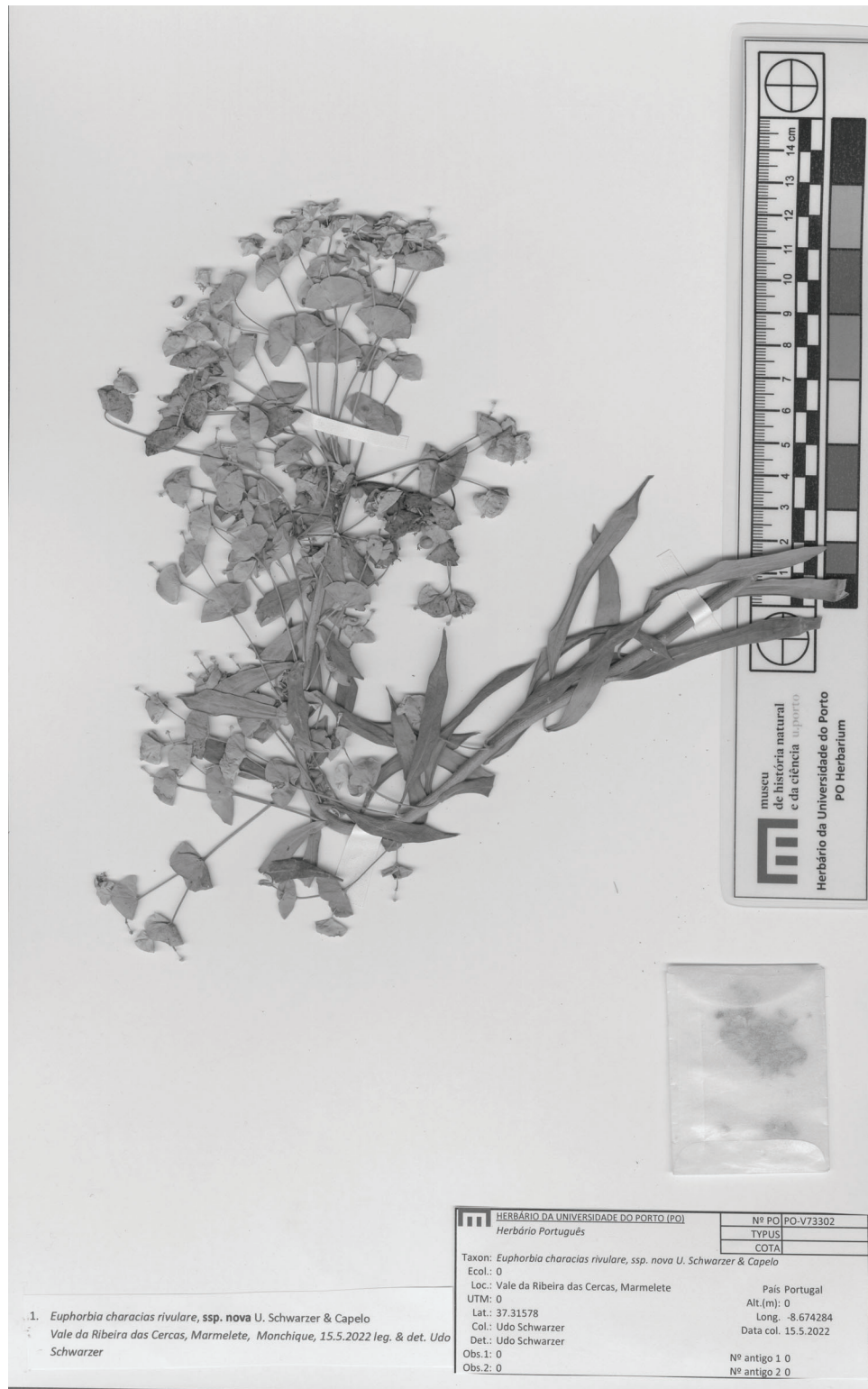
FIGURE 1. Holotype of Euphorbia vicentina U. Schwarzer & Capelo, deposited at PO (sub Euphorbia characias subsp. rivulare ).