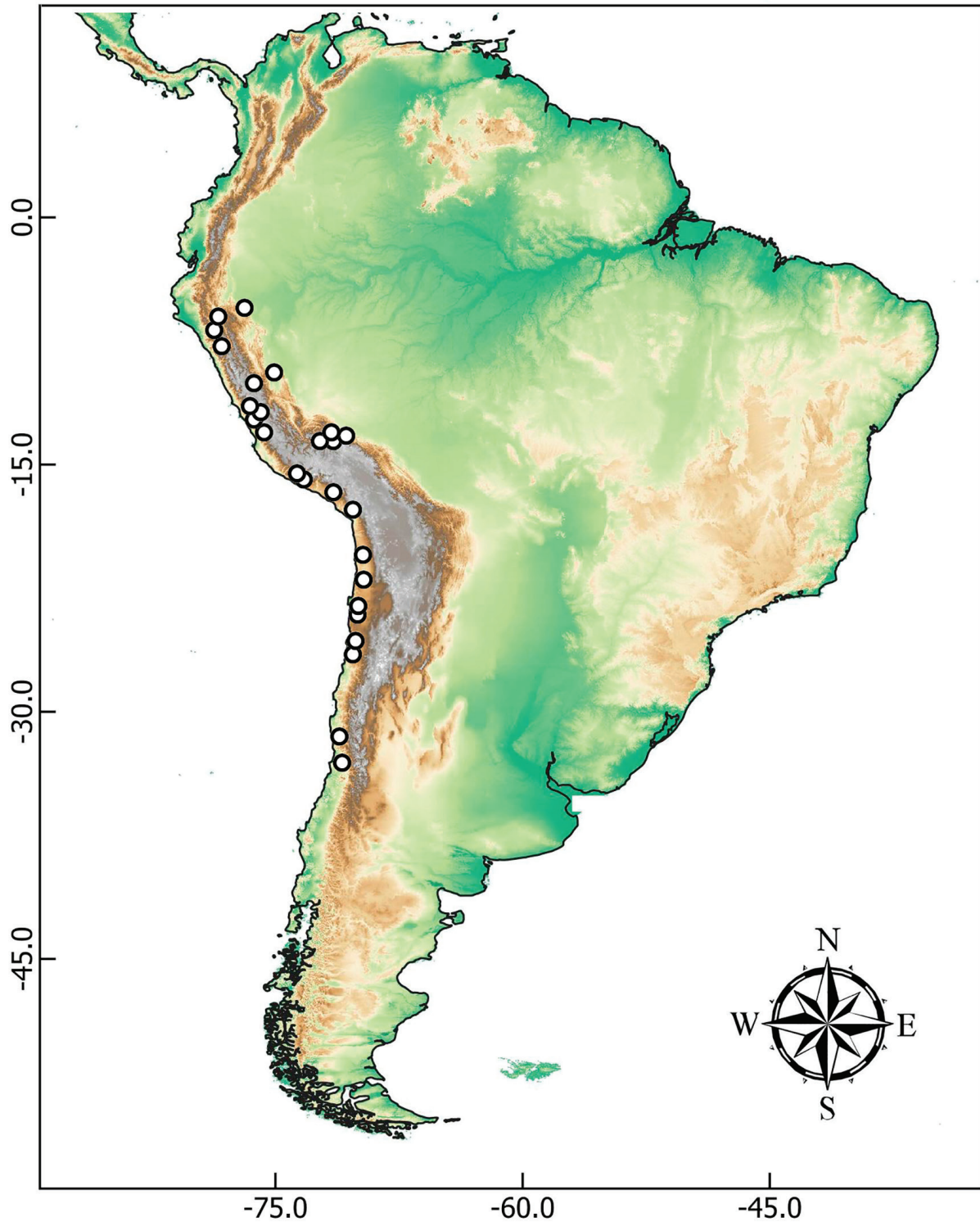
FIGURE 1. Distribution map of Incacoleome Cornejo based on herbarium collections.