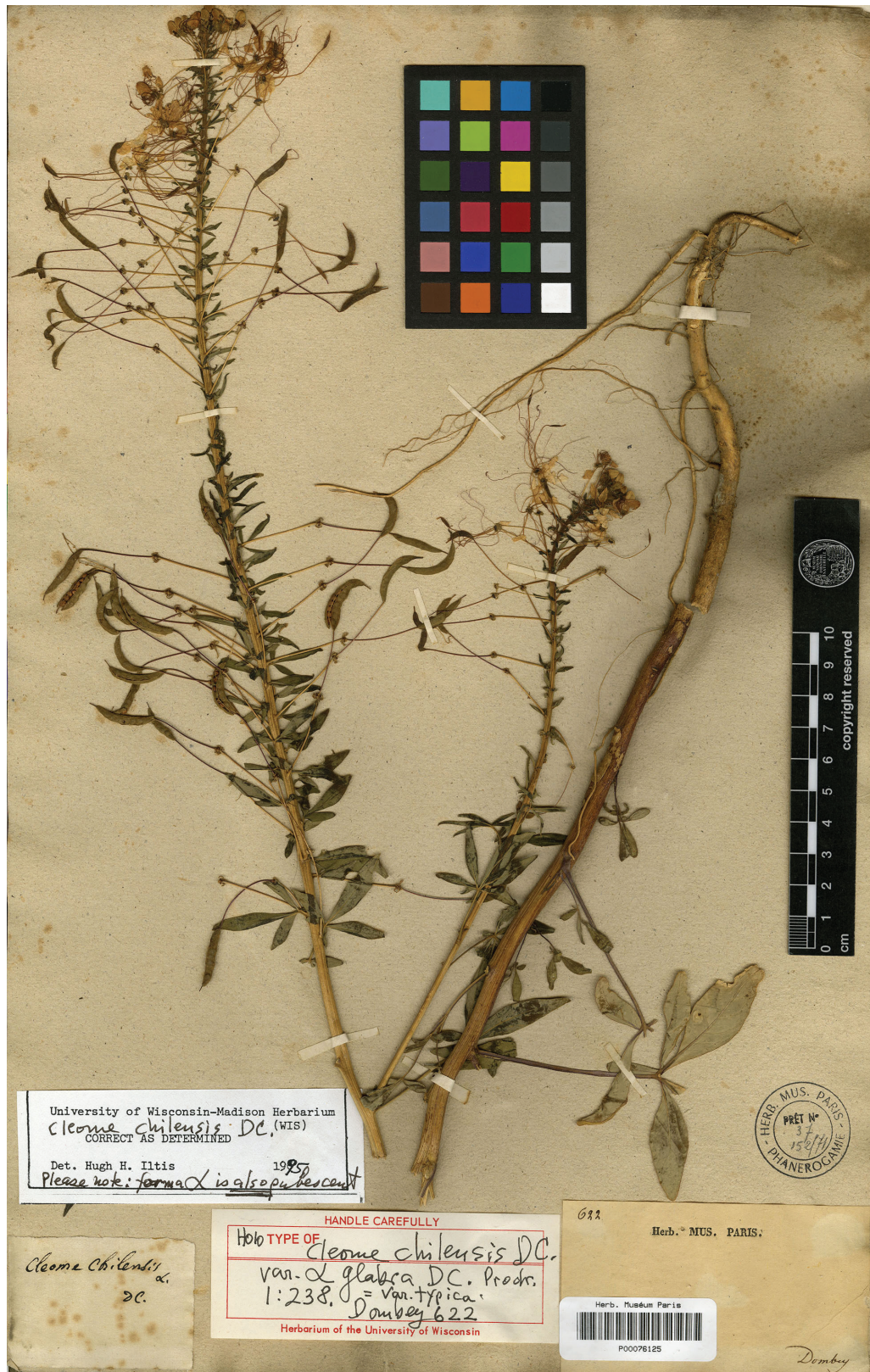
FIGURE 3. Holotype of Cleome chilensis , the nomenclatural type, courtesy of Muséum national d’Histoire naturelle (MNHN)–Paris Herbarium (P).